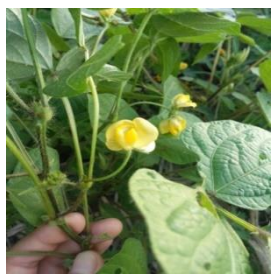
Fig 1. The plant of Vigna mungo L.